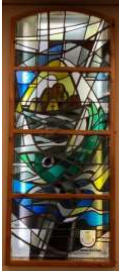
The Loaves and Fishes