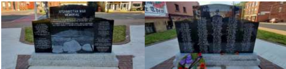
Seen here, the front and back views of the Afghanistan War Memorial in Amherst, Nova Scotia.