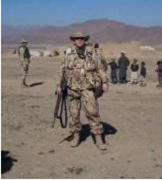
Stopping enroute to a Provincial Reconstruction Team in mountainous Gardez.