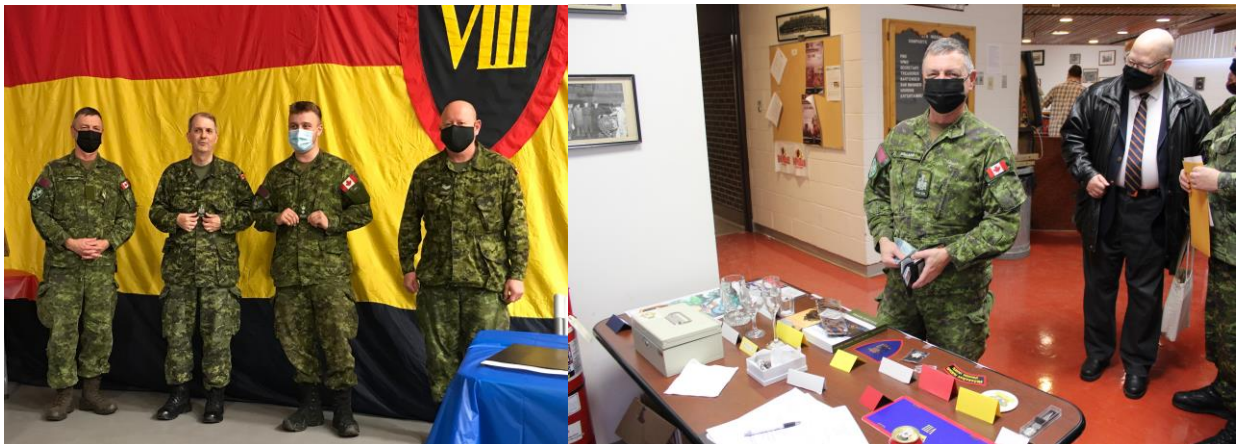
Acting RSM and CO, Soldiers Appreciation Dinner