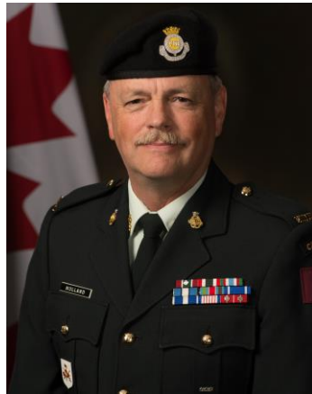
"Regi Patrique Fidelis"

The Last Round. Finally, for myself, I must state that I am honored to have been appointed as your Regimental Sergeant Major. I have served in the Corps since 1985, on Lynx's, Cougars, Grizzly's, Leopards, Iltis, Coyotes, LAVs and TLAVs. Both in Canada and on 6 various missions overseas. Two of those years were as an 8th Canadian Hussar in Germany. After 38 years of both Reg and Res service, I have returned to the Regt. This opportunity to continue to give back is a gift, and I thank you greatly. In closing, more change is coming but we'll take that step together.