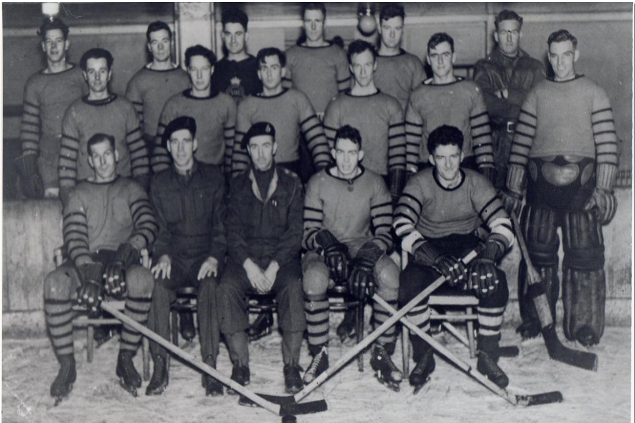
"8th P.L.N.B. Hussars"

2nd Canadian Armoured Brigade Hockey Champions 1943 (England)