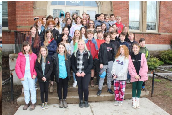
Sussex Middle School

Just prior to opening the museum for the summer we were very pleased to host a number of curators from the Organization of Military Museums of Canada (COMMC) who held their annual meeting in the Maritimes this year. It was an