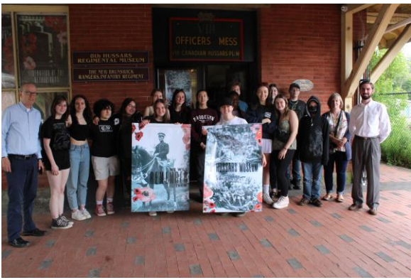
Sussex High School Art Club