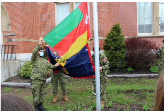
Eelde and Regimental Flags