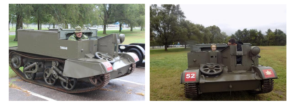
Warming up the Carrier