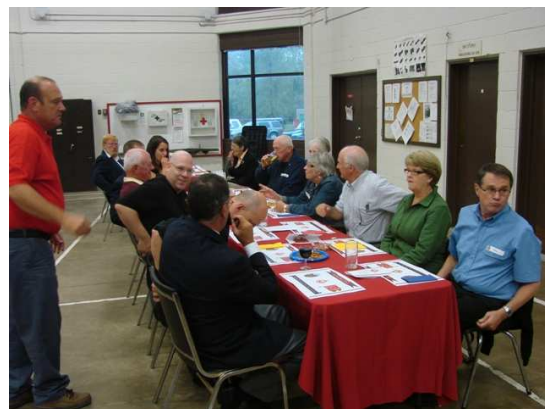
Ready for the Buffet!!!