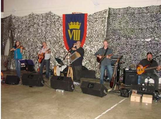
“Bottoms Up” the entertainment for the evening.