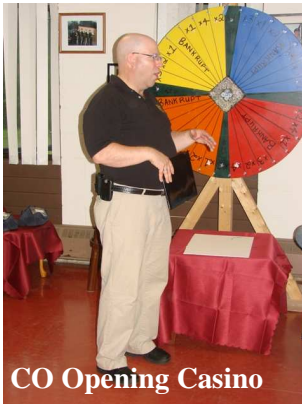
CO Opening Casino