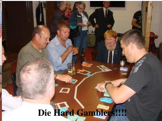
Die Hard Gamblers!!!!