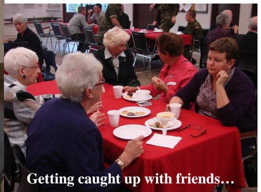
Getting caught up with friends...