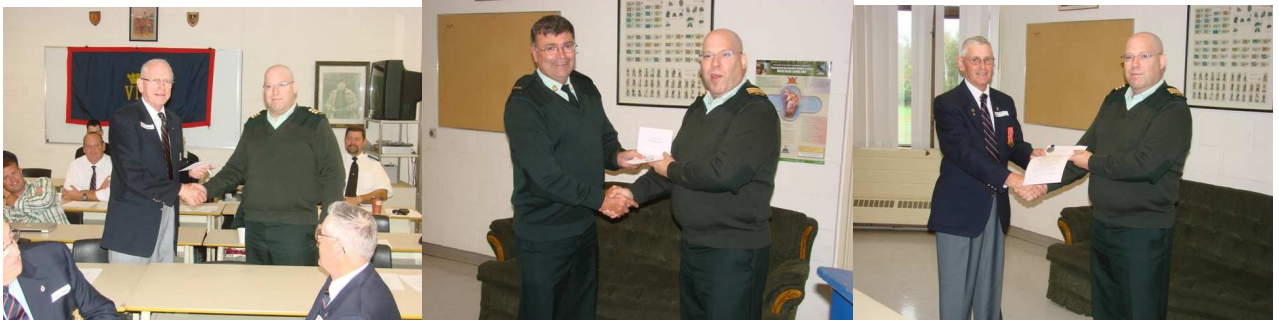
Presentation of Regimental Coins