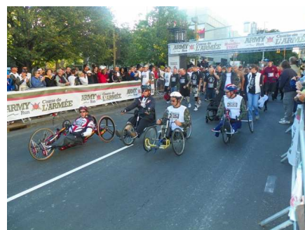
A photo of the injured soldiers before the start of the 5 km race.